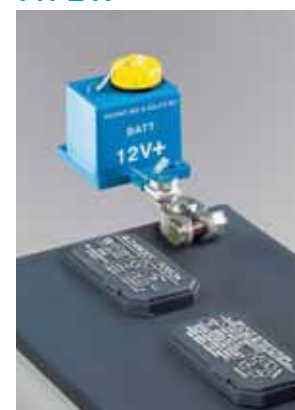
Patent No. 6,424,511,B1